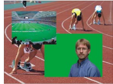
Multi-Format, Dual PIP over an Active Video Background