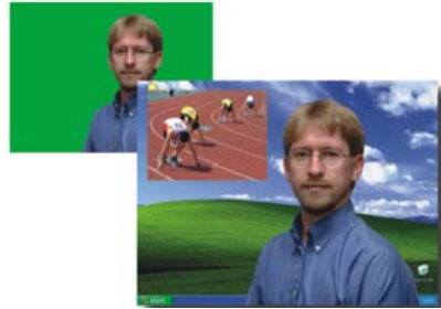
Dual Channel Chromakey with simultaneous PIP Insertion