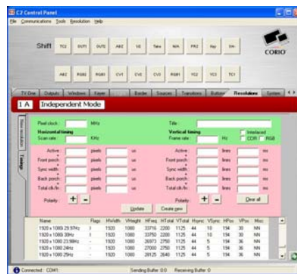
Resolution Editor Menu